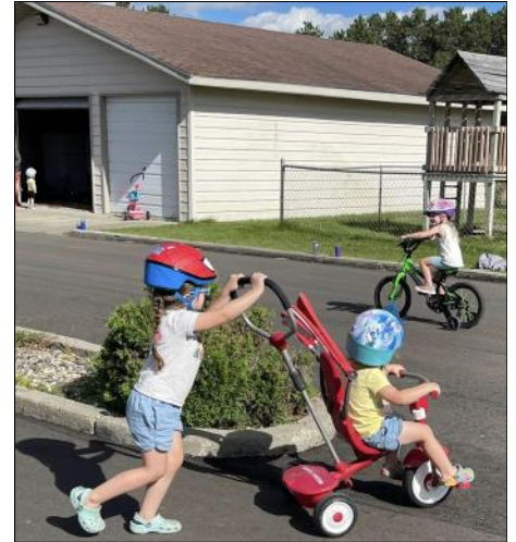
Above: Bike Week, August 29-September 2.