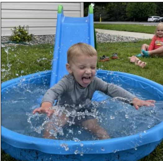
Below: Water week, August 1-5. The kids are 'sliding' into fun, 'painting' with water and running under a 'raining rainbow'. Based on the smiles, I think it is safe to say fun was had by all.