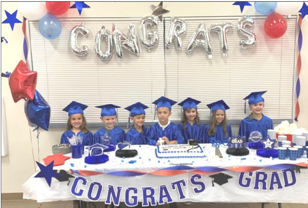
Left: Congratulations to the 5 year olds off to Kindergarten! August 16.