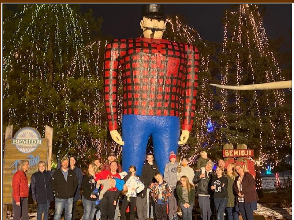
Some of the youth and families who went on the Christmas Lights Tour, December 15, 2021.